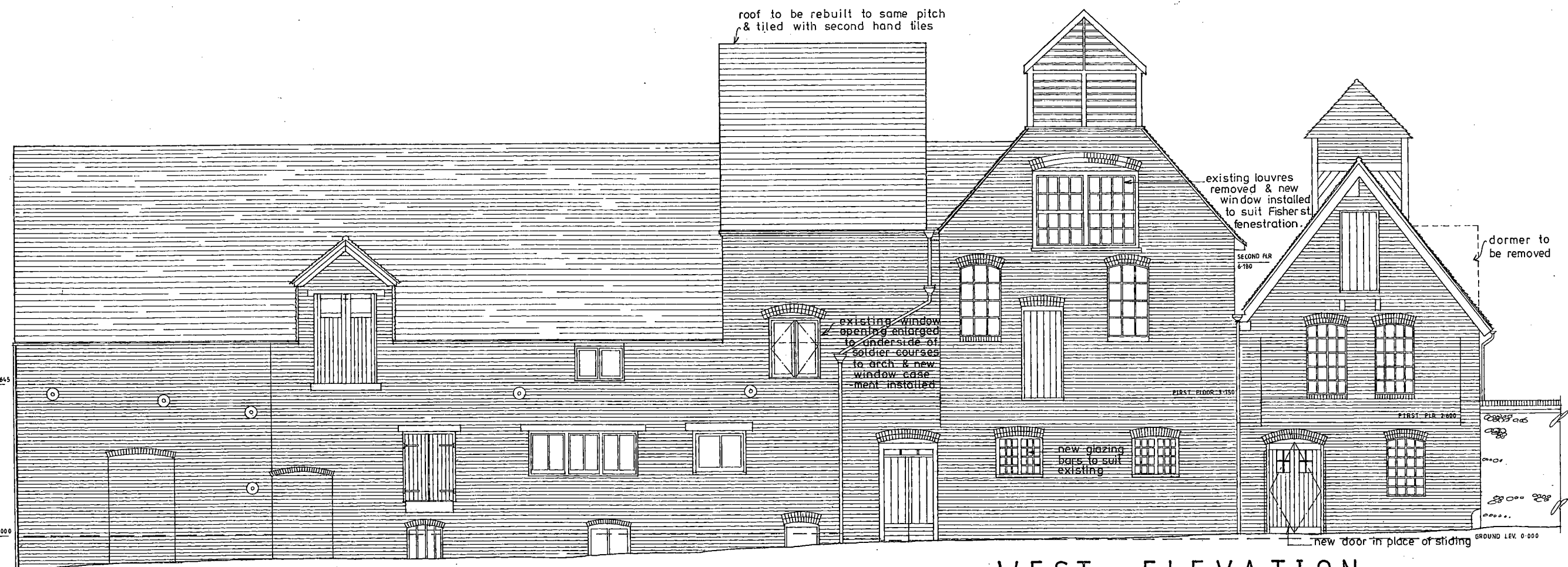
WEST ELEVATION (from castle ditch lane)

rev. A 25/8 FLOOR LEVELS ADDED - DOOR & WINDOWS ADDED & ALTERED TO NORTH ELEVATION - DOOR TO WEST ELEVATION CHANGED (DOUBLE DOOR IN LIEU OF SLIDING DOOR).